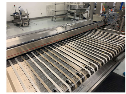
Tubing one table with new process, tubing enters table from cutting equipment to the right

After testing both the guides and controls for the conveyor table, the tubing was noted to be much less tacky and easier to separate. Allowing the tubes more time to cure before contacting other tubes was demonstrated promising results for the continuation of the project following this process.