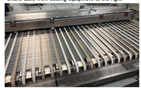
Tubing on the table with new process and guides