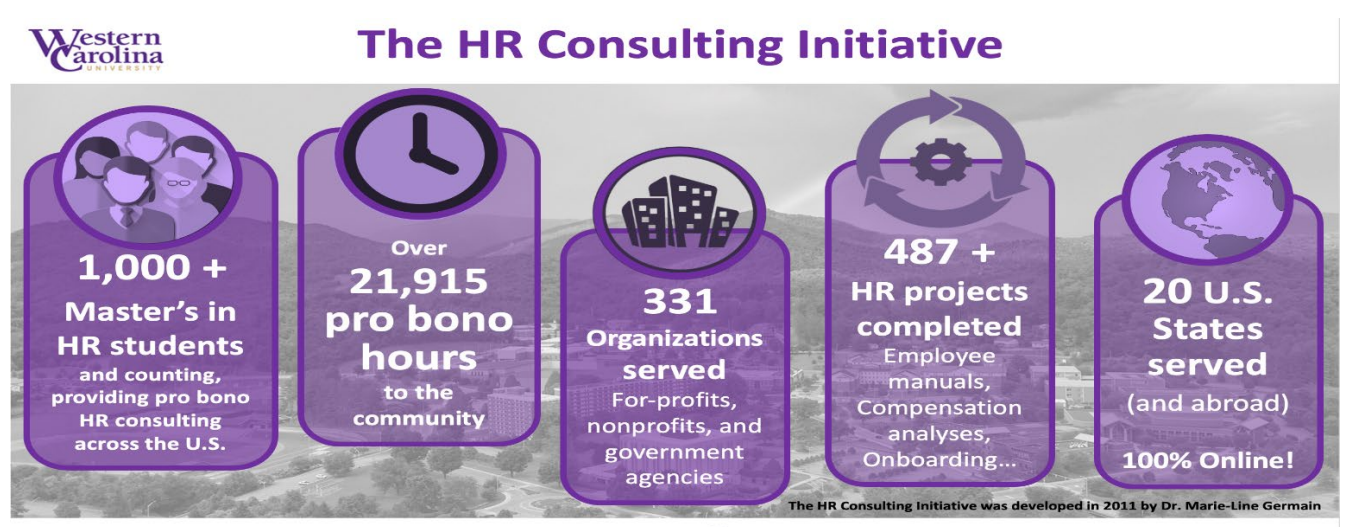
Service-driven • Professional HR work • Varied HR projects 🌑 Become a pro bono client at HRconsulting.wcu.edu