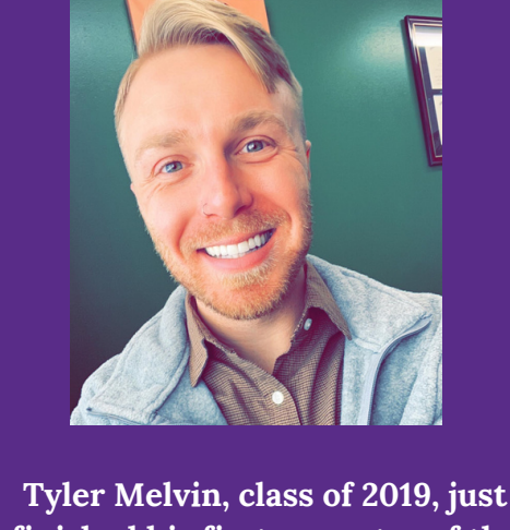
finished his first semester of the Educational Leadership Doctoral Program at New Mexico State University.