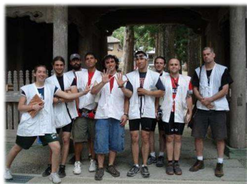
Shikoku pilgrimage in 2009