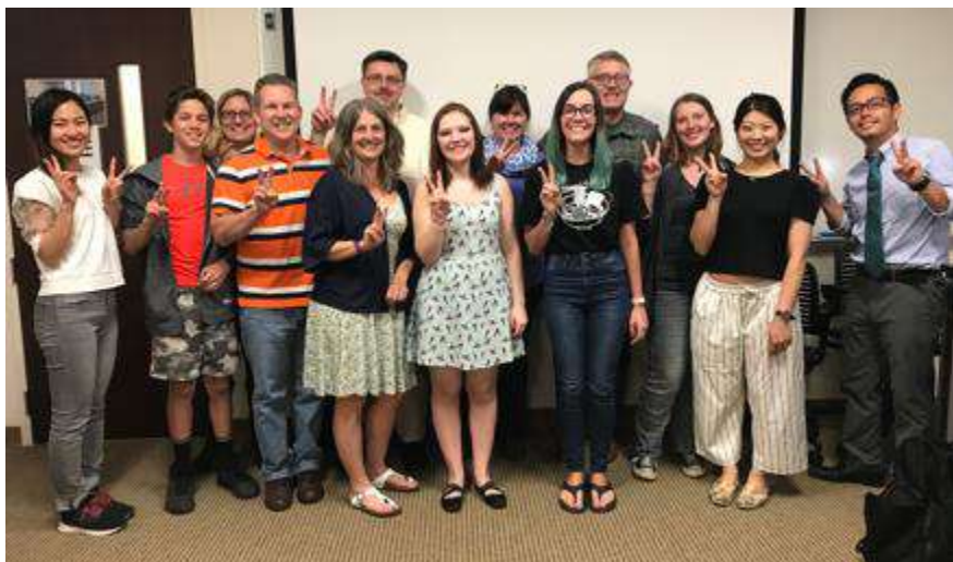
Introductory Japanese Language and Culture

Community Course @ Biltmore: Introductory Japanese Language and Culture was successfully completed. 12 students were enrolled in the course. They survived HIRAGANA and KATAKANA writing and reading practice and have become to be able to ask the price of things at a shop and buy them in Japanese at the end of the course.