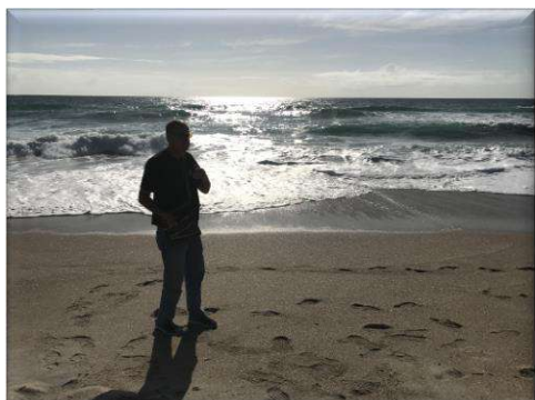
In Wilmington 2017