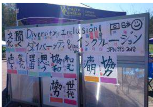
Diversity & Inclusion portfolio from JPN393: Japanese Calligraphy in spring 18