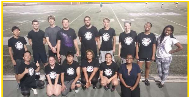
Mt. Fuji All Stars