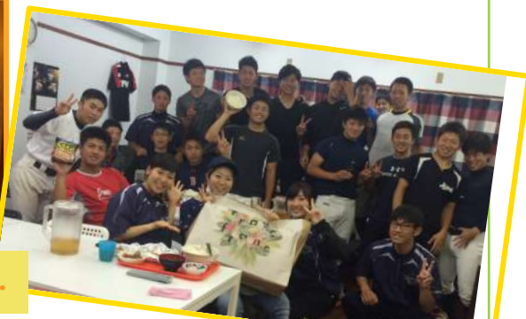
My birthday with Chukyo Univ baseball club.