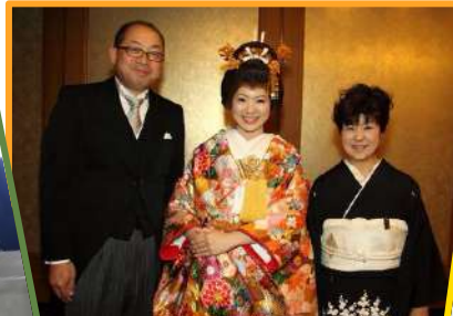
My wedding with my parents.