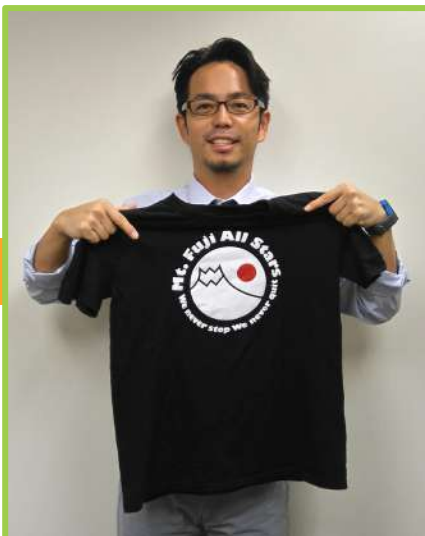
Mt. Fuji All Stars T-shirt