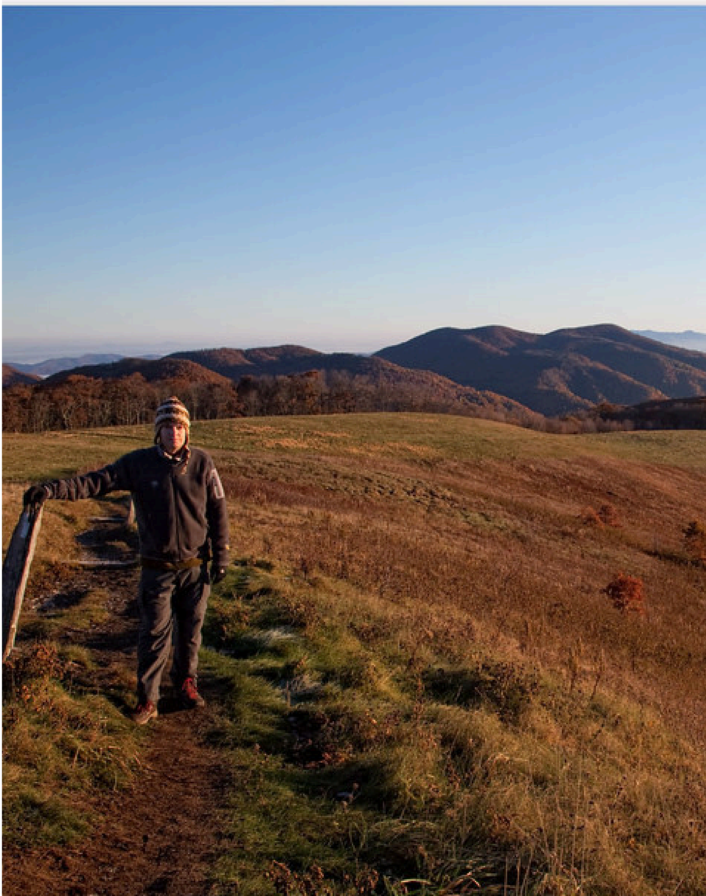
Max Patch Appalachian Trail Hot Springs, NC