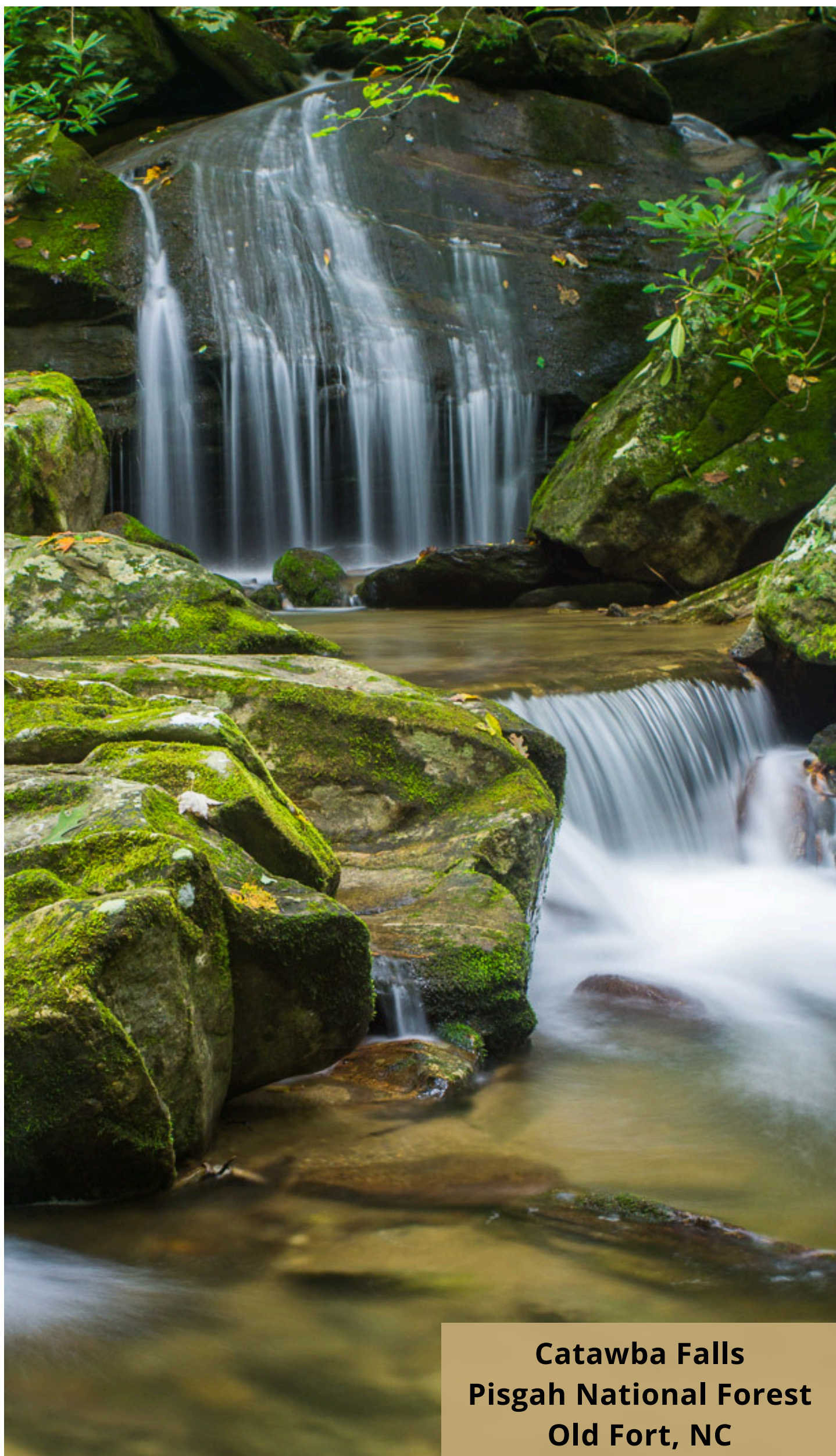
Catawba Falls Pisgah National Forest Old Fort, NC

Western Carolina University is a great place to study Parks and Recreation Management—just look in its backyard! WCU offers access to the Great Smoky Mountains National Park, Nantahala National Forest, scenic rivers, lakes, trails, and more. This outdoor classroom creates an ideal environment to learn about leadership, conservation, and recreation. Choosing WCU’s PRM program means gaining valuable education while experiencing the beauty of Western North Carolina.