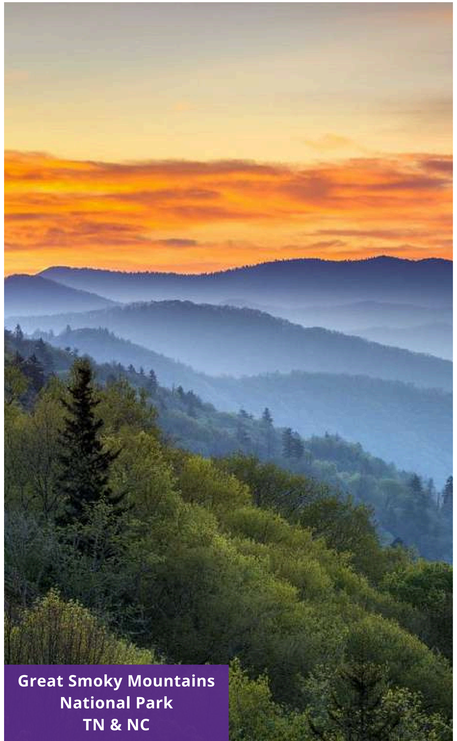
Great Smoky Mountains National Park TN & NC