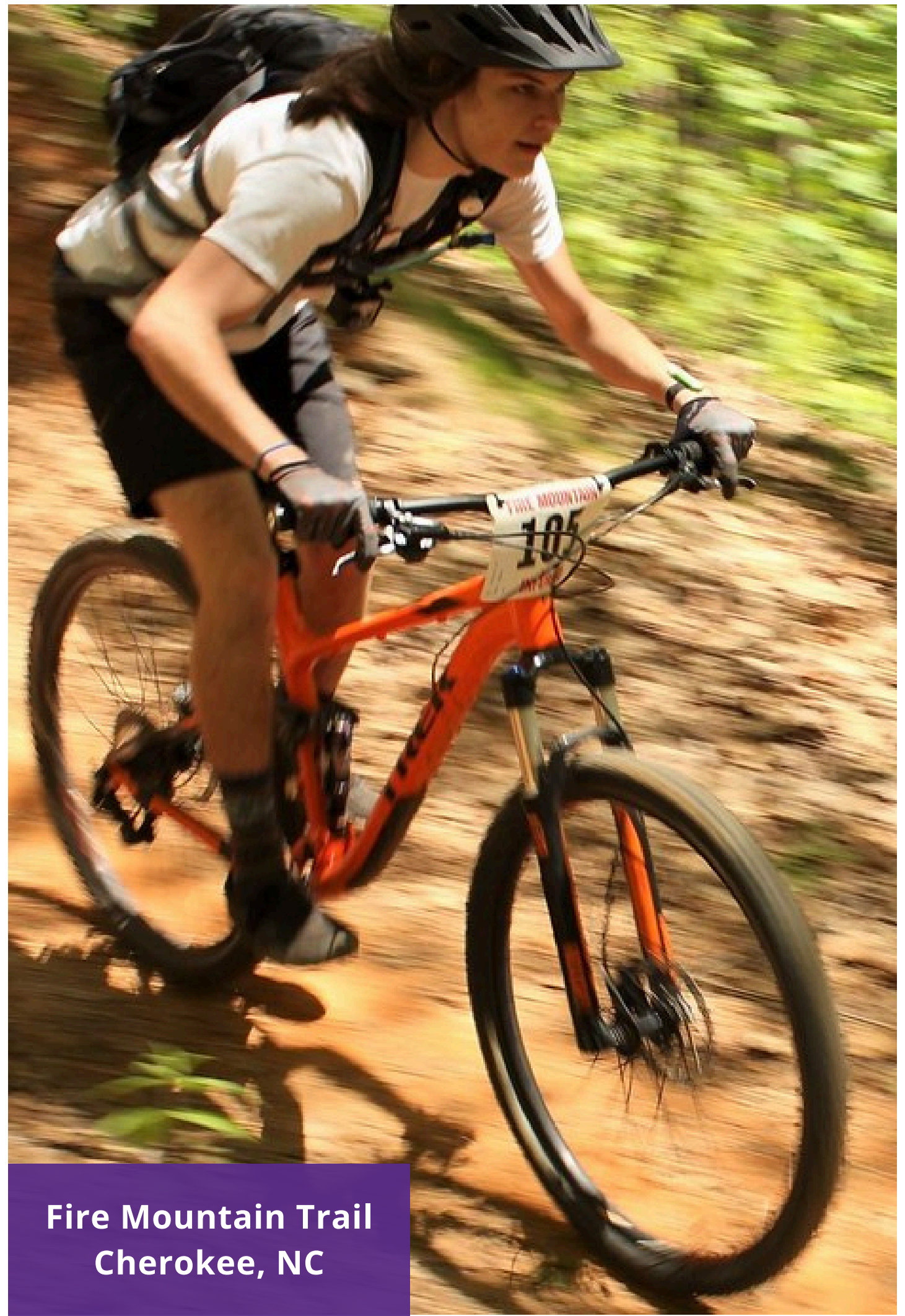
Fire Mountain Trail Cherokee, NC