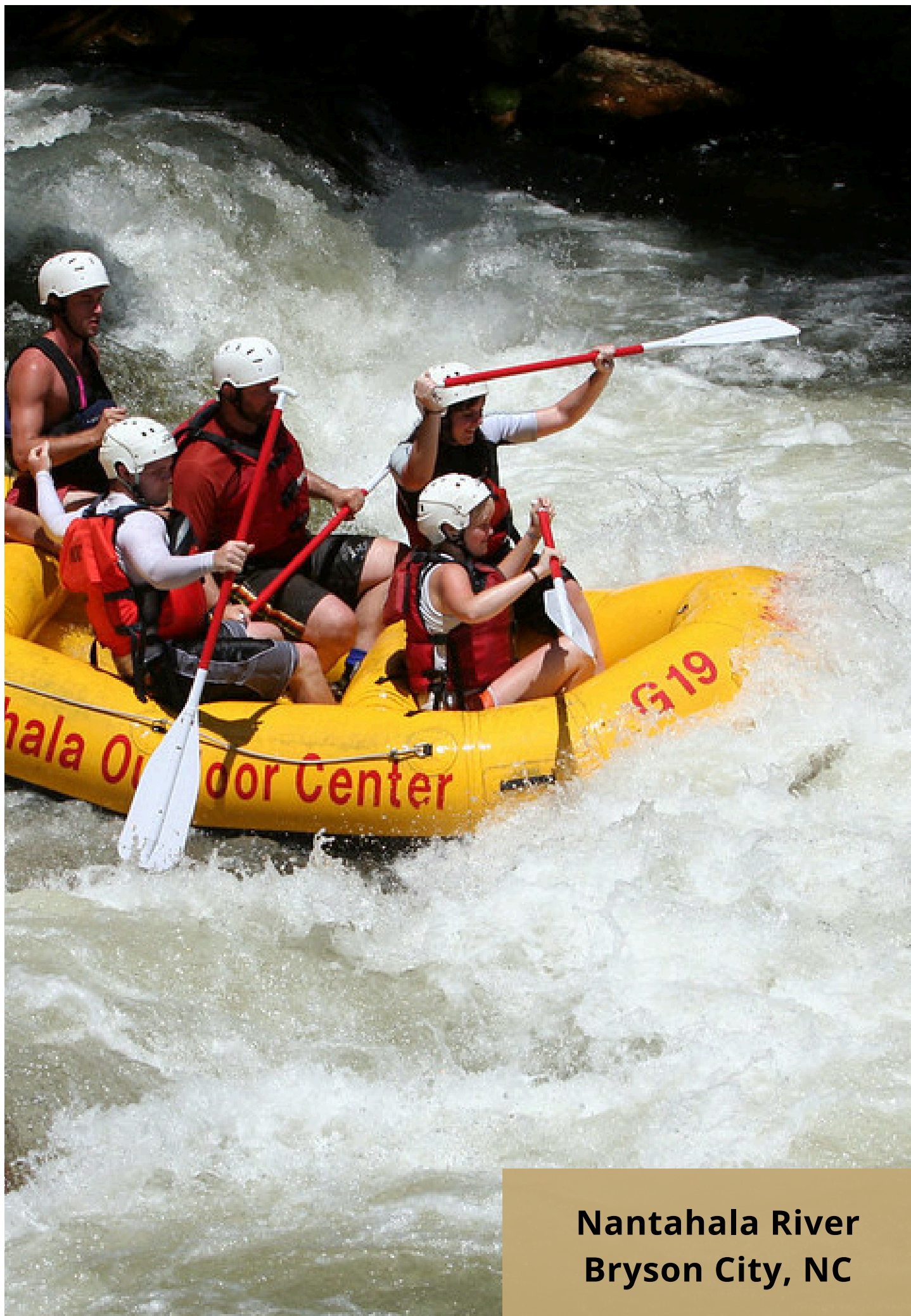
Nantahala River Bryson City, NC