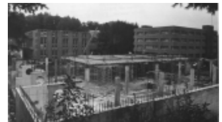
New Addition Construction

One of Kirwan's first challenges was to keep the need for new library space in the forefront. A major physical expansion of the building became possible in 1978 when the state General Assembly allocated over five million dollars for an addition and renovation of the older structure. During the next months the architects, Six Associates of Asheville, produced working drawings, and bids on the project were awarded in early 1980. Work