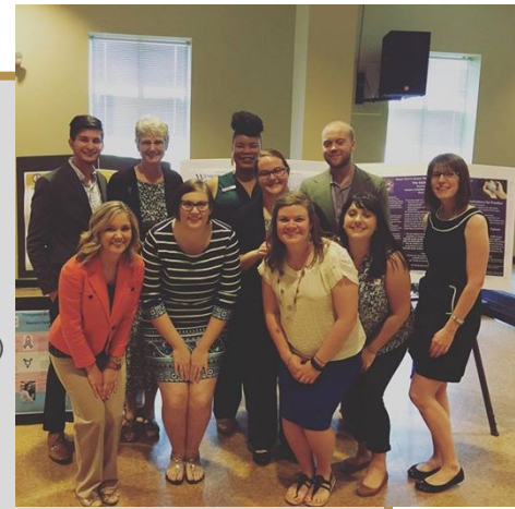
Right: HESA Students and Provost at the first-ever Research Mini-Conference at WCU (April)