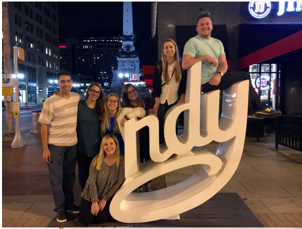
Left: HESA Students and Faculty at NASPA in Indianapolis (March)