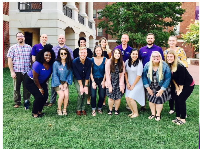
Fall 2017 Student Enrollment: 15 in Year 1 Cohort; 14 in Year 2 Cohort; 7 Part-Time Students (New Fall 2017 HESA Students pictured above)

EDRS 602, also known as Methods of Research, is an introductory research course for master's students in a variety of disciplines. The goal of the course is to take students from consumers to critical consumers to producers of research. In EDRS 602, we talk about the importance of disciplined inquiry in professional decision making. Students select a personal area of inquiry and read literature and explore this topic throughout the semester. What you see today is the culmination of their semester long commitment to the topics they selected.