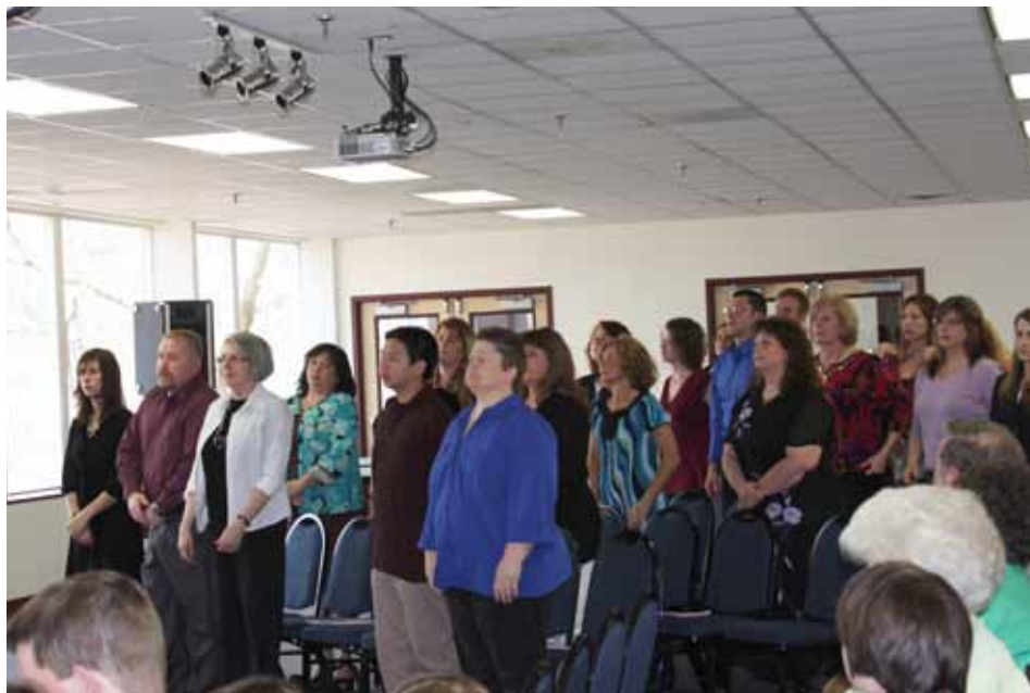
Eta Psi Inductees Spring 2010