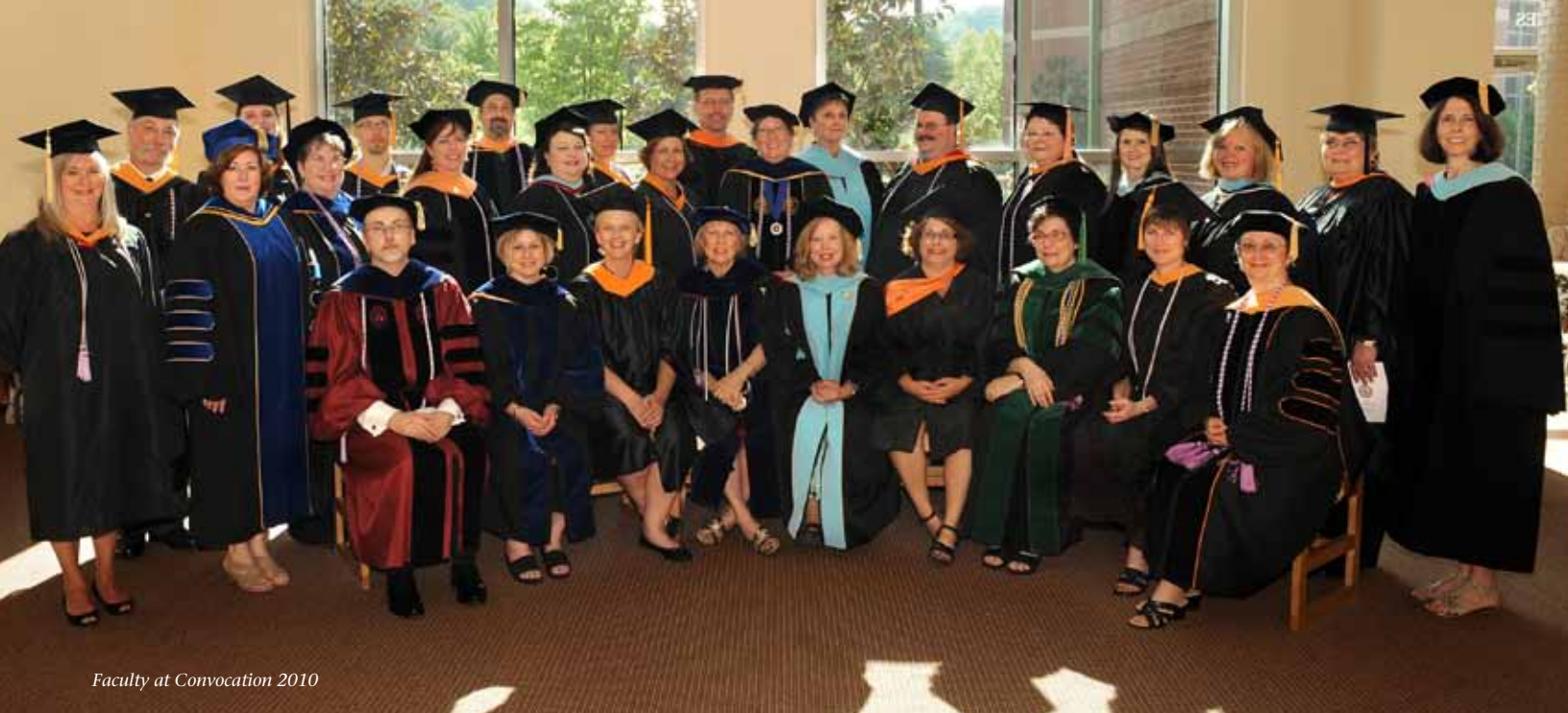
Faculty at Convocation 2010