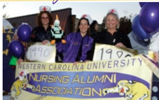
Nursing alumni reconnect at Homecoming.

include an alumni breakfast, special tailgate parties and reunion luncheons for the classes of 2001, 1996, 1991, 1986, 1981, 1976, 1966,