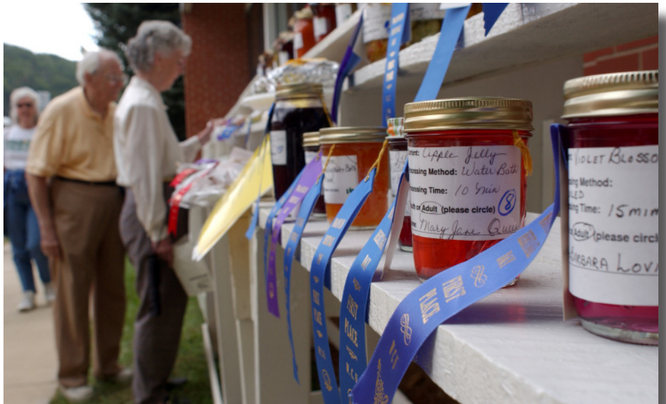
Mouth-watering exhibits of award-winning jams, jellies, canned vegetables, pies and biscuits will be on display at the festival. Save room for the cider, barbecue and Cherokee fry bread.

Western will be commemorating three decades of celebrating traditional Appalachian culture as this year's Mountain Heritage Day. For the few who have never experienced the festival, imagine a combination old-fashioned mountain fair and showcase for authentic Appalachian folk arts, infused with the spirit of a big family reunion. A visit to the festival provides a memorable mosaic of sights, sounds and smells that keeps many first-time visitors coming back year after year. And they do keep coming back, as attendance at Mountain Heritage Day regularly tops 25,000.