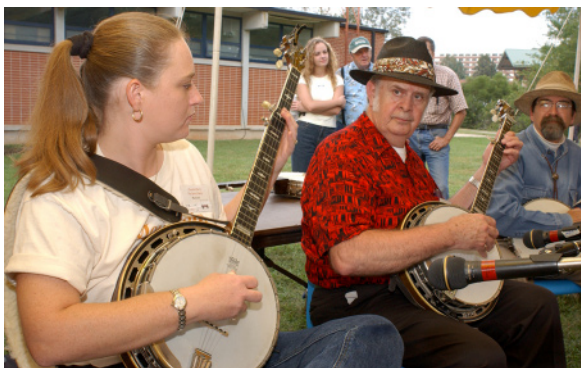
Bluegrass lovers will be entertained by the many groups performing at the festival, including banjo players.

The festival also offers several just-for-fun competitions, including a 5K footrace, horseshoes, checkers matches, an antique auto show, costume contests for women and children, a beard and moustache contest for men, and a preserved foods contest. The festival woodcutting contest is always a crowd favorite, with chain saw and crosscut saw masters from across the nation competing against one another.