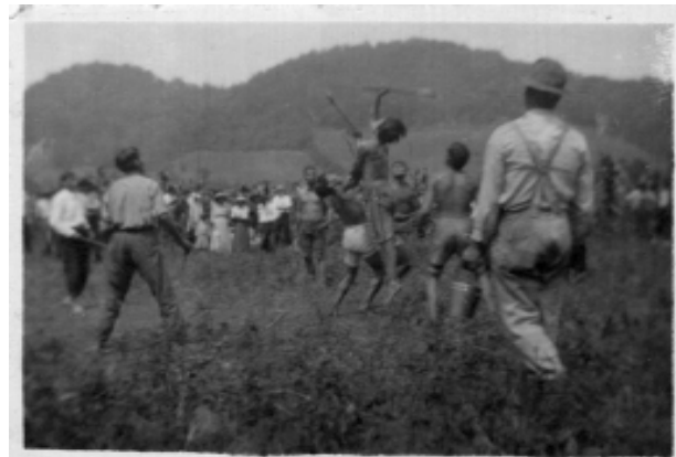
Stickball Game - circa 1920

Additional state and federal microfilm sets provide enrollment records for the Eastern Cherokees dating from 1835 to the 1930s. In addition, Eastern Band council records of the early 20th century, in both the English and Cherokee languages, were obtained from the North Carolina Archives & History. Other sets of note include the Lyman Draper manuscripts from Wisconsin's State Historical Society and Cherokee Mission records (1816-1859) in the Papers of the American Board of Commissioners for Foreign Missions from Harvard University.