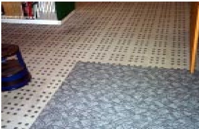
Out with the Old - In with the New!

If you haven't been in the library for a while, we think you'll be pleasantly surprised by the changes that have been made. First, the main floor and grand stairwell of the library were re-carpeted during the summer. We used carpet tile that will enable us to more easily accommodate changes in the layout of bookshelves, etc. The carpeting gives the library a fresh look.