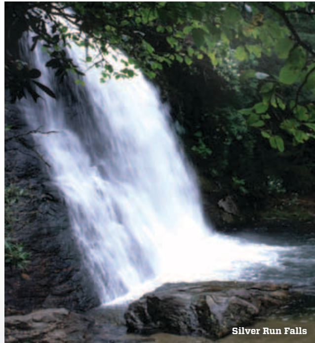
Silver Run Falls

Directions: From campus, take Hwy 107S to Cashiers. Go through town and about 4 miles past the stop light, there will be a pull off on the left side of the road. The trail to the falls is about ¼ mile and you will cross the Whitewater River.