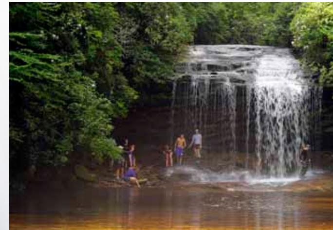
Cullowhee Adventure Guide Produced by: PRM 434: High Adventure Travel Spring 2011