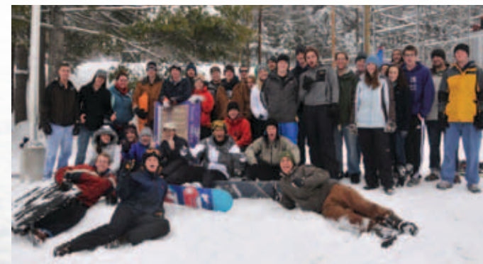
Cullowhee Adventure Guide Produced by: PRM 434: High Adventure Travel Spring 2011

Western Carolina University is a University of North Carolina campus and an Equal Opportunity Institution. XXX copies of this public document were printed at a cost of $XXX.XX or $0.XX each. Office of Creative Services: July 2011 11-475