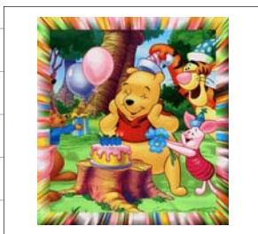
Happy Birthday Teaching Fellows!!