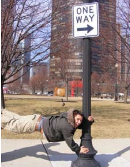
Almost blown away, during the scavenger hunt! They don't call it the Windy City for nothing!

On Sunday evening, portions of our group floated from the hostel to the outside world, experiencing the sights and sounds of Chicago. That night, we all ecstatically