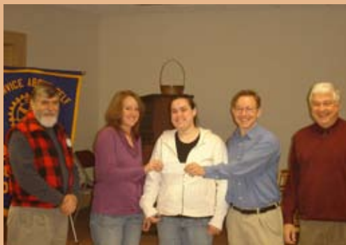
The Sylva Rotary Club provided a donation toward Project Panama.