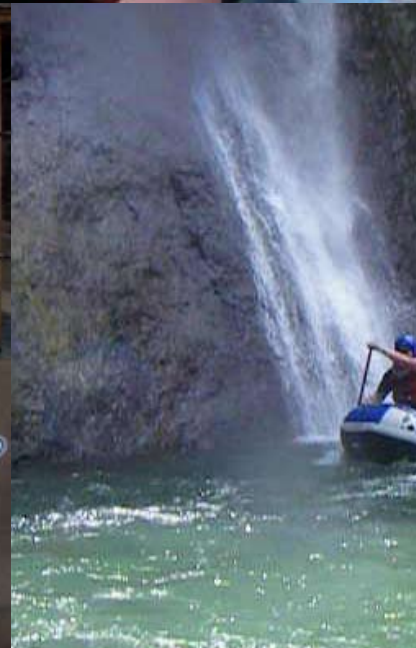
Design: Clint Hardin, WCU Printing Department