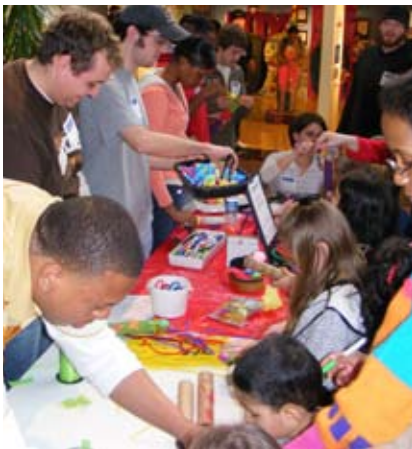
ASB-ers assist with children's activities in Chicago.