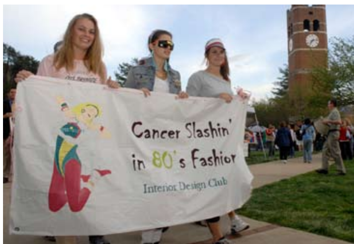
RELAY FOR LIFE: This WCU event raised $21,000 for the American Cancer Society.