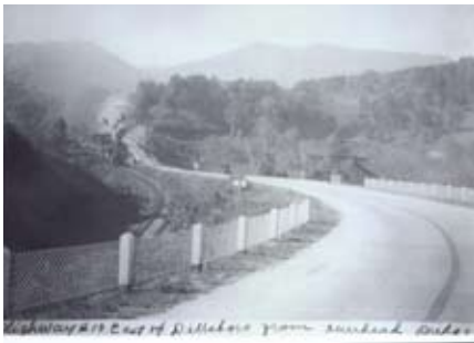
The Monteith Farmstead is on the right in this photograph taken circa 1930.