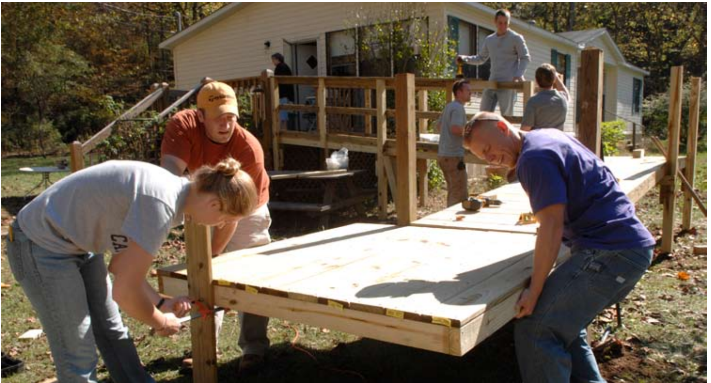
Construction Management students add a handicap ramp to a Caney Fork house near the WCU campus. Construction Management is a program in the Kimmel School.