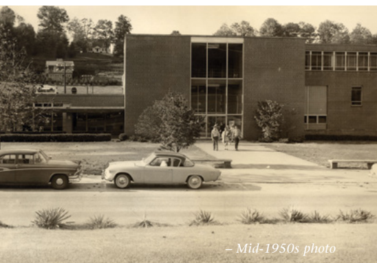
— Mid-1950s photo

The original main entrance to the library will be open again if a proposed future renovation of the building becomes a reality. The entrance has not been used in more than 30 years. It was closed in 1981 when the library expanded and the main entrance moved to the side of the building facing Stillwell and the Natural Sciences buildings. Through the years, visitors have commented that the current entrance is hard to find. The original library building was largely planned by Lilian Buchanan, who was the WCU librarian from 1932 until 1967. She traveled to other campuses to study their libraries and Hunter Library bore a noticeable resemblance to Harvard's Lamont Library when it was completed in 1953.