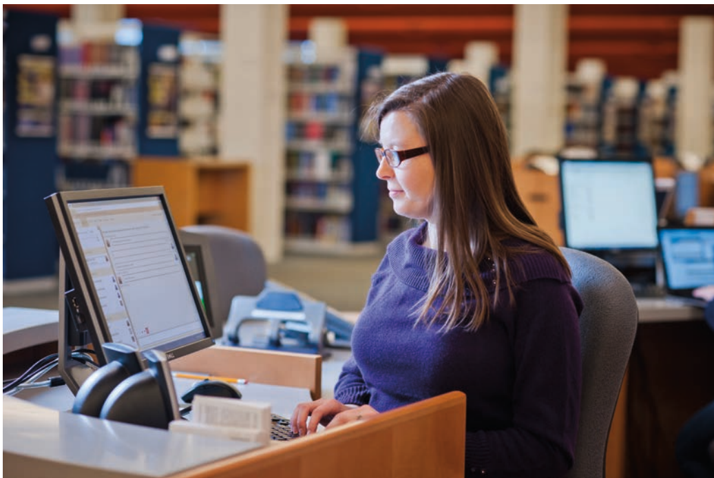
Reference chat service.

On Nov. 9, 2015, "Long Night Against Procrastination," offered an evening of concentrated help at the library for students seeking assistance with specific academic goals. Tutors from the Writing and Learning Commons joined Hunter librarians for the event.