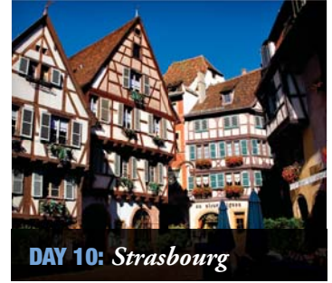
DAY 10: Strasbourg