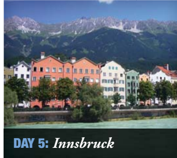
DAY 5: Innsbruck