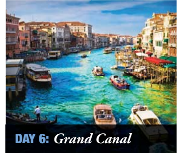
DAY 6: Grand Canal