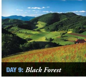
DAY 9: Black Forest