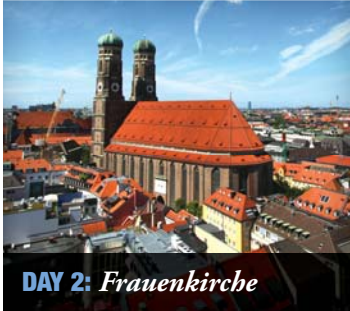
DAY 2: Frauenkirche