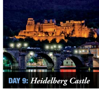
DAY 9: Heidelberg Castle