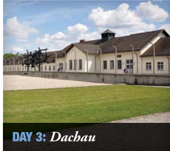
DAY 3: Dachau