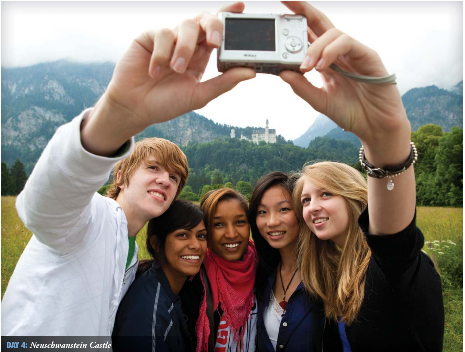
DAY 4: Neuschwanstein Castle