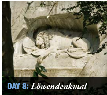
DAY 8: Löwendenkmal

Extend your tour and enjoy extra time exploring your destination or seeing a new place at a great value.