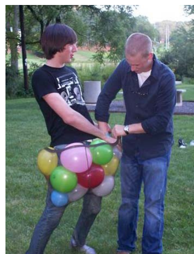
Playing games at the picnic

It's that time of year again! School is back in session, and to kick-off the annual Freshmen-Sophomore Retreat WCU Fellows enjoyed a weekend of fun! Beginning on Friday night, we enjoyed a picnic on campus at the Picnic Pavilion. The picnic provided an opportunity for sophomore mentors to get to know their freshman mentees. While at the picnic we ate delicious barbeque, visited, and played games. The weekend continued early Saturday morning when we loaded two buses and traveled to Gatlinburg for the day. We visited the Ripley's Aquarium of the Smokies before having lunch. After lunch, we visited Ripley's Believe it or Not Museum in downtown Gatlinburg, followed by a round of mini-golf. After a long day of fellowship and fun, we were exhausted and headed back to Cullowhee.