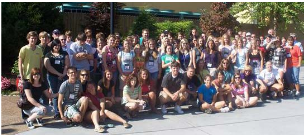
Freshmen and Sophomore Teaching Fellows at Ripley's Aquarium of the Smokies

It's that time of year again! School is back in session, and to kick-off the annual Freshmen-Sophomore Retreat WCU Fellows enjoyed a weekend of fun! Beginning on Friday night, we enjoyed a picnic on campus at the Picnic Pavilion. The picnic provided an opportunity for sophomore mentors to get to know their freshman mentees. While at the picnic we ate delicious barbeque, visited, and played games. The weekend continued early Saturday morning when we loaded two buses and traveled to Gatlinburg for the day. We visited the Ripley's Aquarium of the Smokies before having lunch. After lunch, we visited Ripley's Believe it or Not Museum in downtown Gatlinburg, followed by a round of mini-golf. After a long day of fellowship and fun, we were exhausted and headed back to Cullowhee.