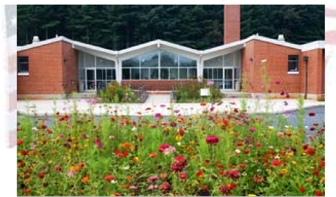
Military Student Services is located in Educational Outreach in the Cordelia Camp Building